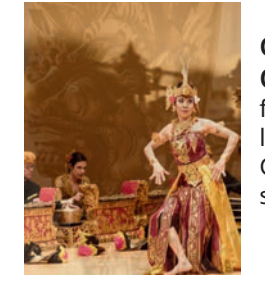
Gamelan - A Balinese Percussion Orchestra • Thursday, March 27, 2025 featuring musicians from Sekaa Gong Mandala Giri from Appalachian State University and Gamelan Giri Murti from Wake Forest University.

Piano and violas come together in a lush program highlighting the dark, rich voice of the viola! Works by Brahms, Bridge, and more.